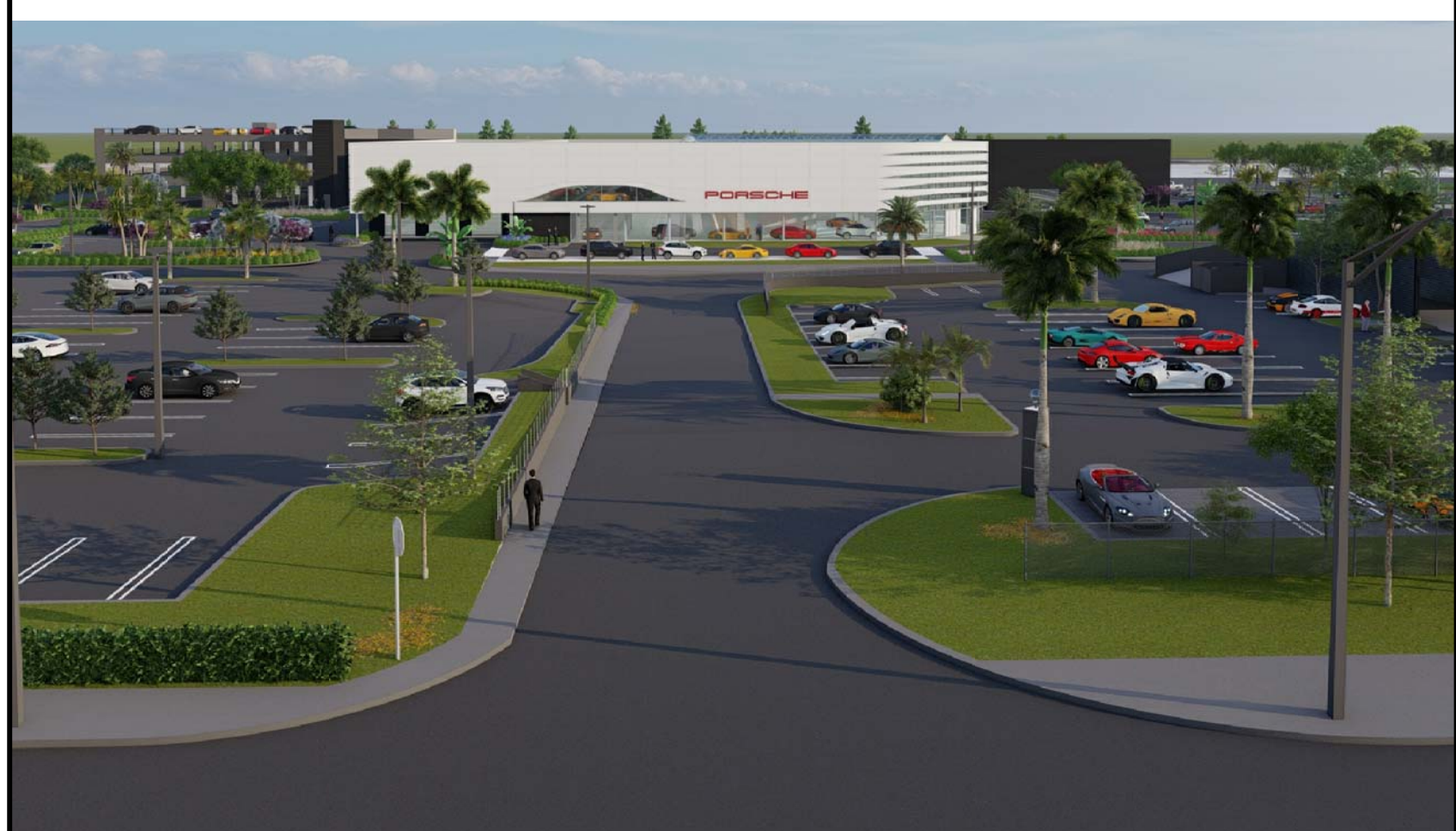
Aerial Main Drive View South