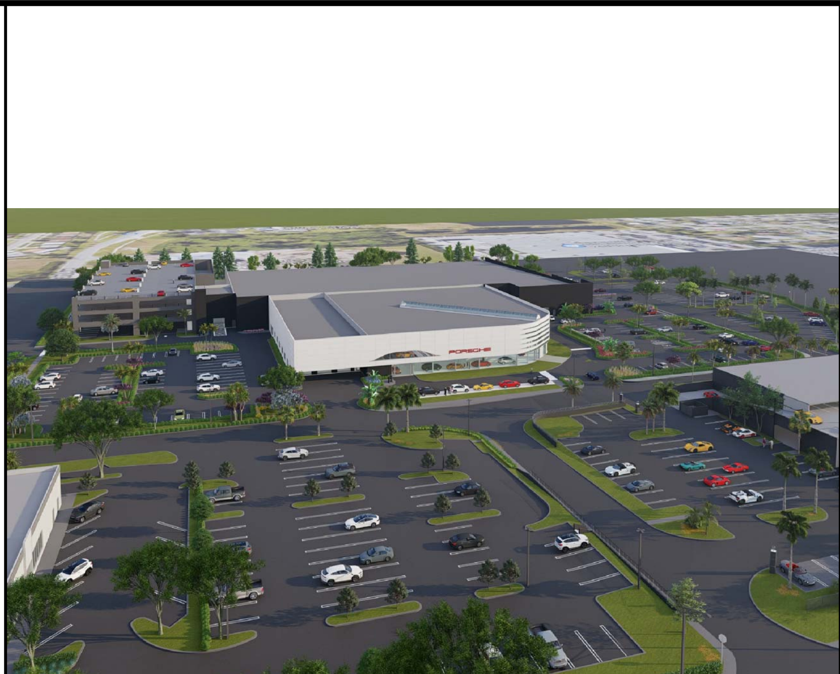
Aerial View South