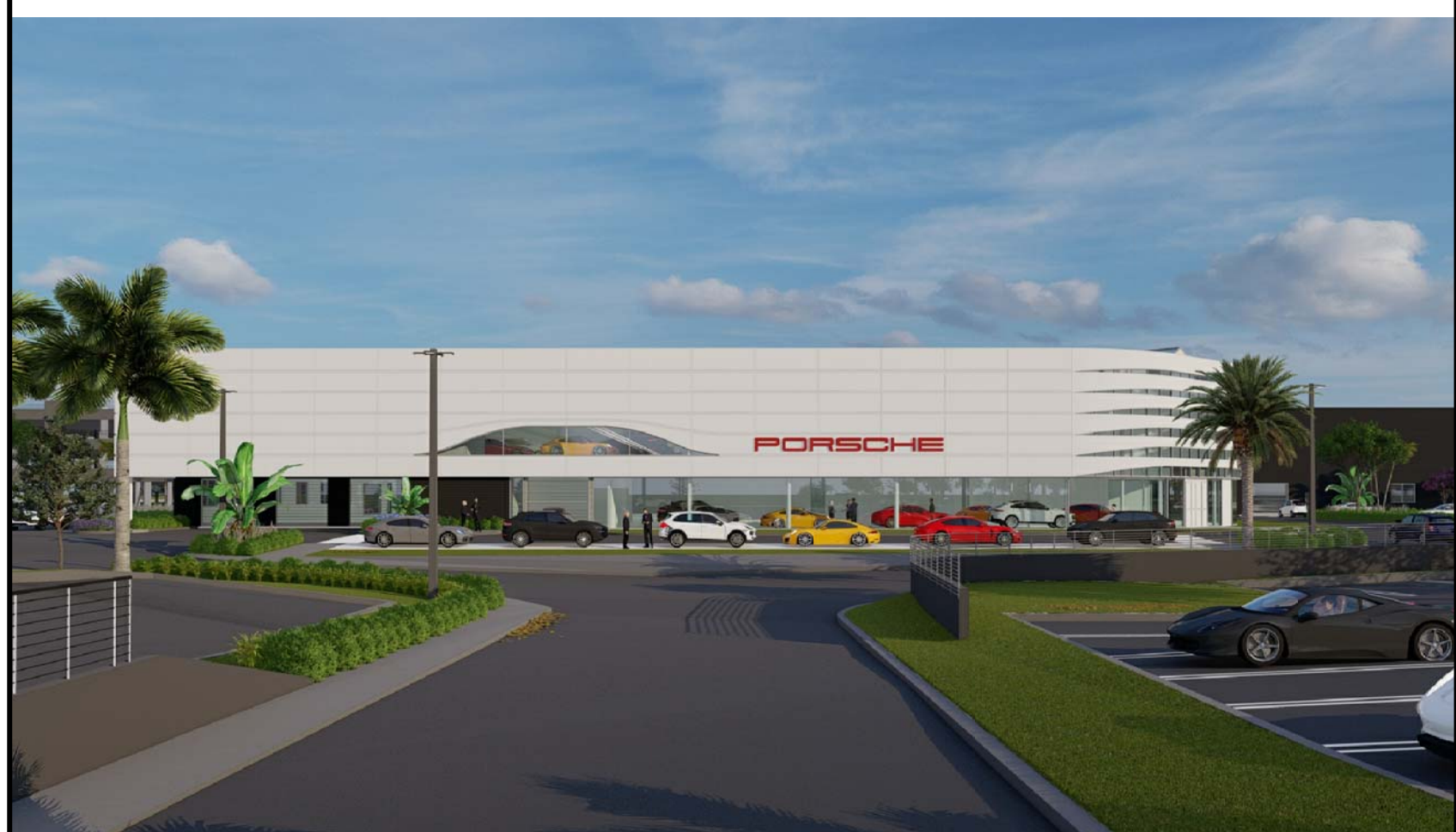
Main Drive View South